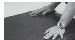
SAND TO REMOVE GLAZE AND IMPROVE ADHESION