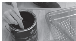
STIR WELL BEFORE AND AFTER APPLICATION